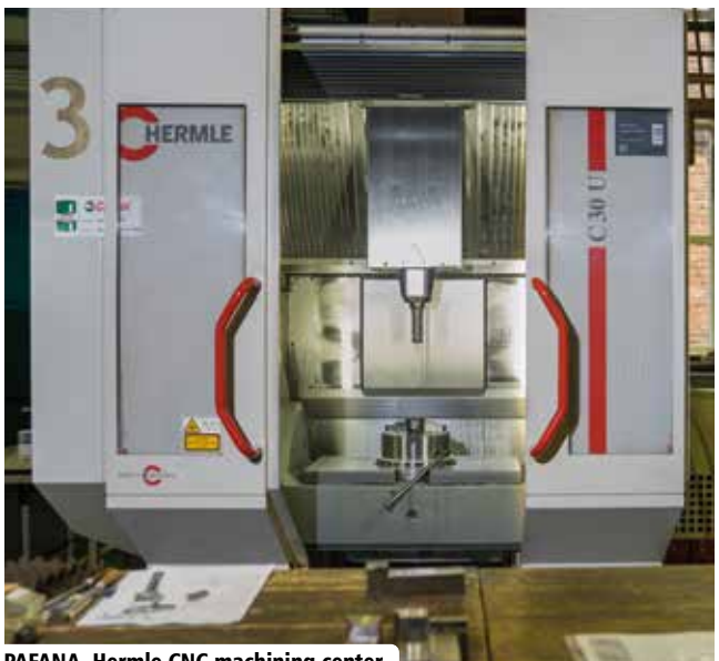
PAFANA, Hermle CNC machining center

"We give shape to the prosthesis using a subtracting machining," explains Andrzej Styczyński. "The second method, which will be used in thigh bone implants, is a laser treatment of surfaces that come into contact with the bone. The surface interfacing with the bone should be laser-modified to achieve better biocompatibility and osteosynthesis. We've already found a modification that gives the implant's surface the appropriate porosity, matched to the size of the bone's cells,