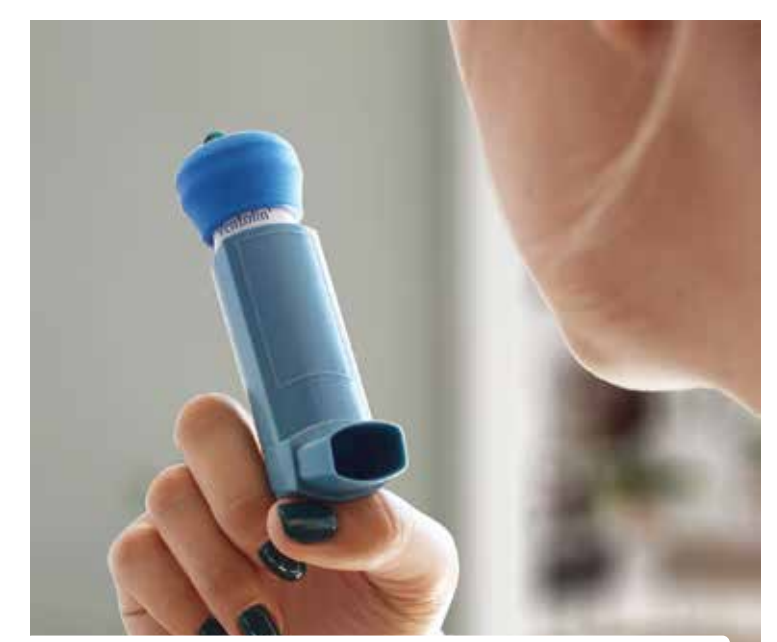
Intelligent FindAir ONE attachment mounted on an inhaler for treating asthma

"As has been shown by interactive research, a video engages the user 16 times more and he or she is likely to devote twice as much time to this medium when compared to traditional marketing communication," explains Natalia Ciosek. "A consumer with the Runvido application can watch a film on the product itself, e.g. on a cereal box or one containing furniture to assemble. Using the solution