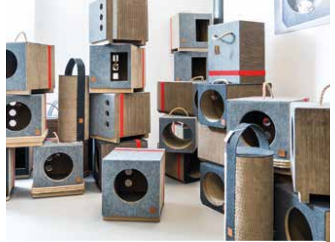
A wide range of ecological MIOOU furniture will satisfy different tastes

Cats don't need a MIOOU furniture user manual because they know how to use it right away. The house also serves as a playground: the jute cord – which is a carrying handle – is a chew toy as well. The openings at the back encourage cats to stick their paws inside and grab their toys. They can scratch the piece from any side and in any position. They can also rest by lying on the piece or hide inside it. The transparent side walls make it possible for the animal sitting inside to observe what is happening outside while remaining hidden. In addition to design and functionality, quality is very