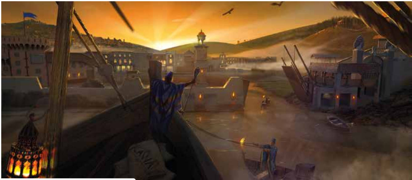
Mandoria illuminated by the rays of the rising sun

The Mandoria amusement park will take you back to the Renaissance and show you how wealthy trade cities operated. Historic tenement houses and harbour docks will be accompanied by thematic roller coasters, merry--go-rounds and many other attractions. Thanks to the commitment of an international team of artists who pay attention to the smallest details, guests crossing the gates