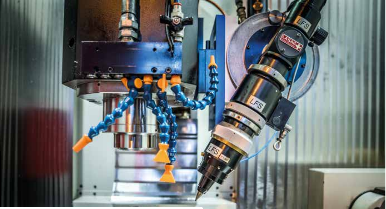
Laser head machining at the Da Vinci center at Pabianicka Pafana Tool Factory

together to select the right material, while a team of specialists from Pabianicka Fabryka Narzędzi Pafana is dealing with its proper processing.