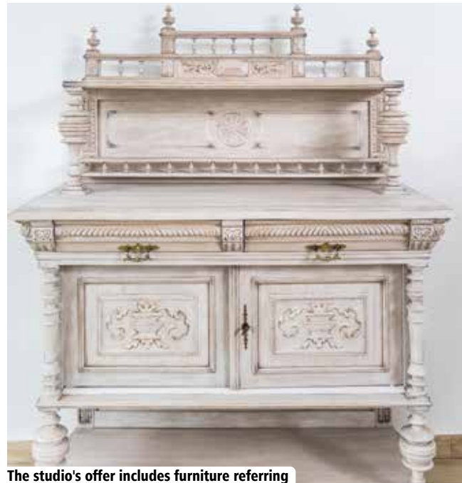
to the Louis and Provencal style

The studio does not limit its social activities to the vocational activation of employees of the "Good Start" VDC, but also participates in other projects, such as the Gala of Socially Involved Entrepreneurs.