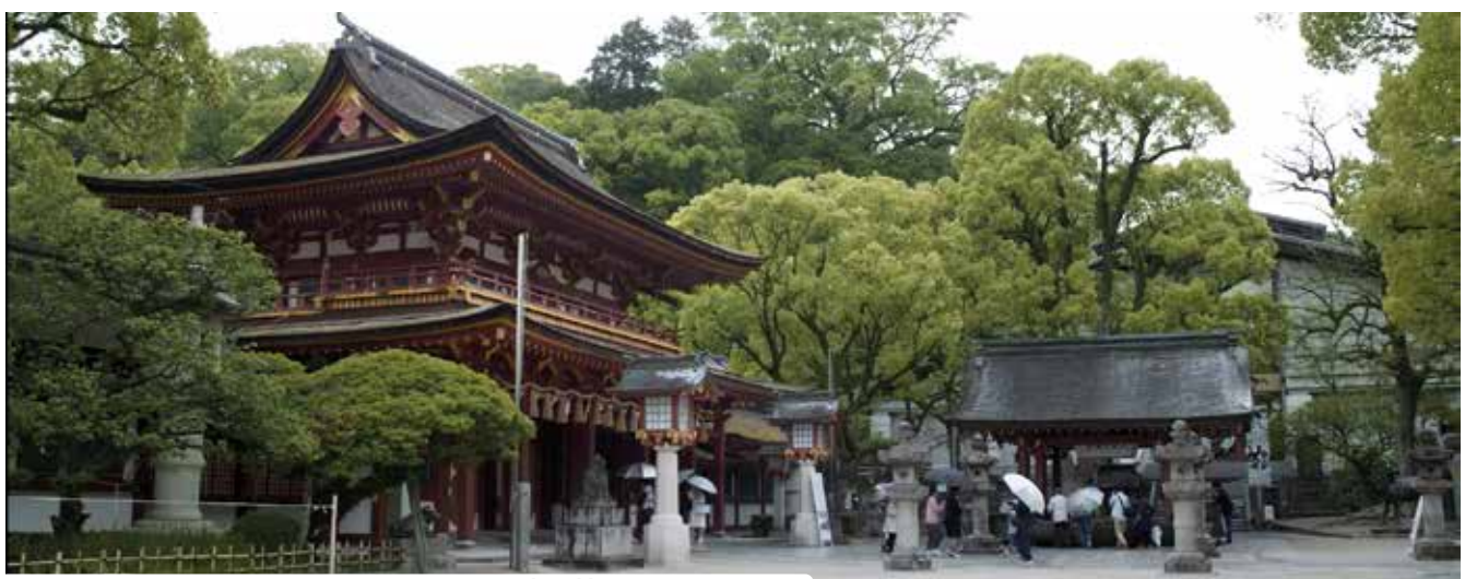
Still from the Shinto movie trailer: Kami No Michi, produced by Potato, Japan 2019

yourself and using film allows one to intrigue and show oneself from the best side," he explains.