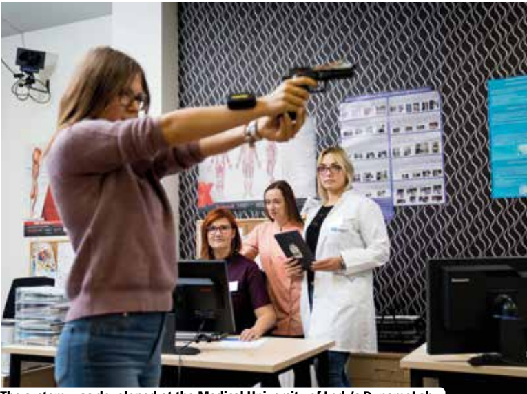
The system was developed at the Medical University of Lodz's DynamoLab, Academic Laboratory of Movement and Human Physical Performance

The system's creators want to extend it with new modules, including the Marvel Balance,